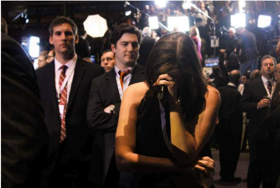
Pic. 1 — (9:53 p.m.) At Mitt Romney's election night headquarters, immediate reactions of grief and shock followed Fox News' sudden announcement of President Obama's re-election victory.

(Boston 2012) These were taken in the hour before and after Mitt Romney's concession speech at his election night rally.