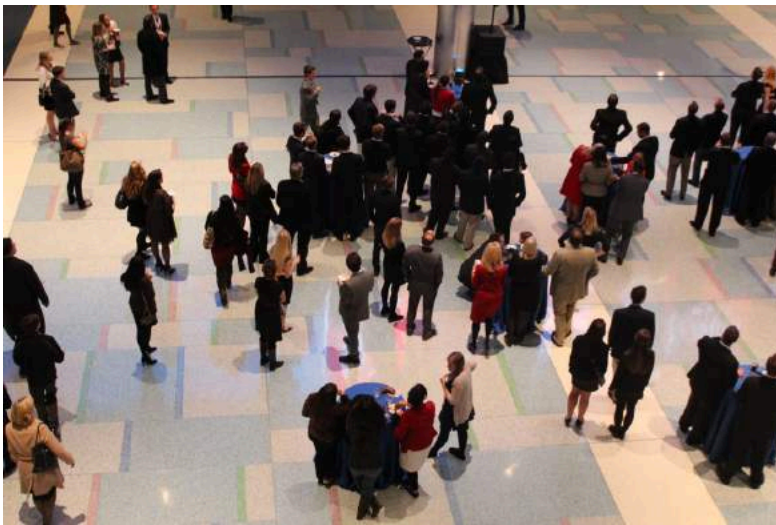
Pic. 4 — (6:20 p.m.) The Election Night Rally for Mitt Romney appears sparsely attended given the size of the grand ballroom at the Boston Convention Center.