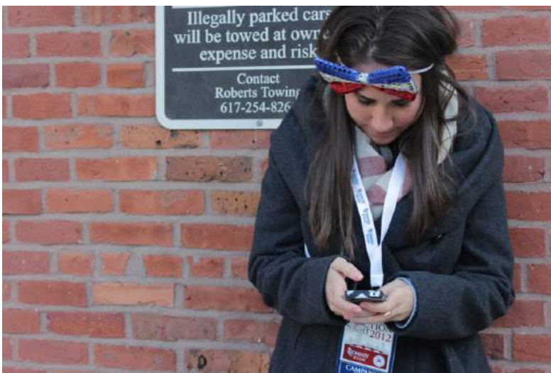
Pic. 5 — (7:28 a.m.) Early morning in Boston, Campaign staff dressed in festive attire to line up at the voting booths.