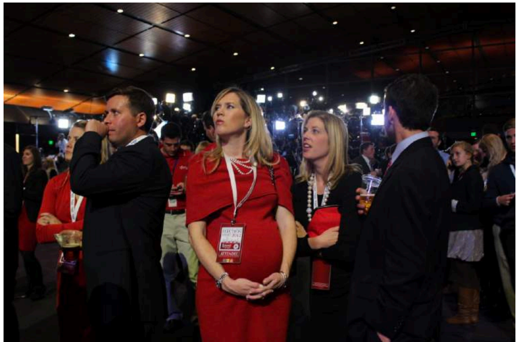
Pic. 2 — (7:35 p.m.) Early in the evening, campaign donors dressed for a celebratory evening gathered in the rally hall to watch the election returns on Fox News.